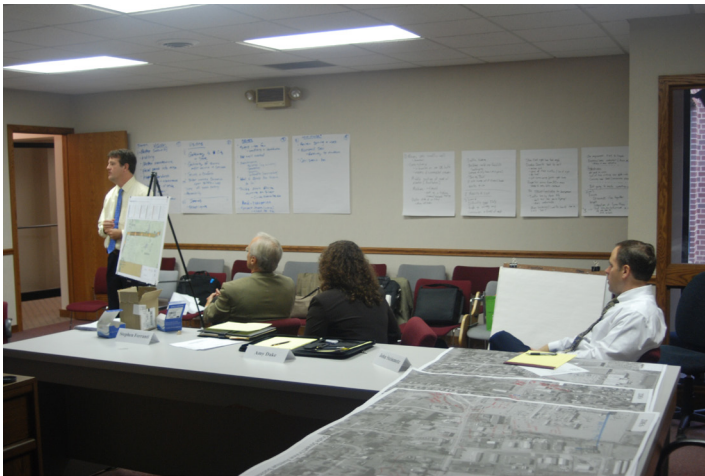
Steering Committee Meeting