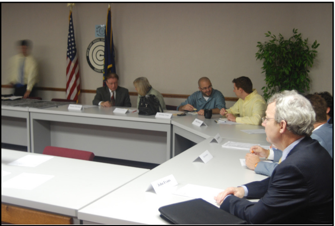
Steering Committee Meeting

At the beginning of the study, a Steering Committee was formed to establish corridor-wide priorities and to guide the study in the best interest of both Cities. Members of the committee include represen-