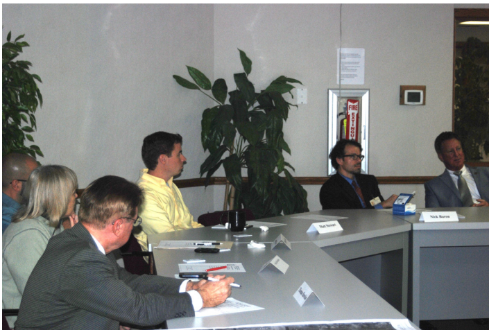
Steering Committee Meeting