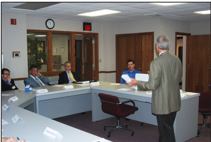
Steering Committee Meeting